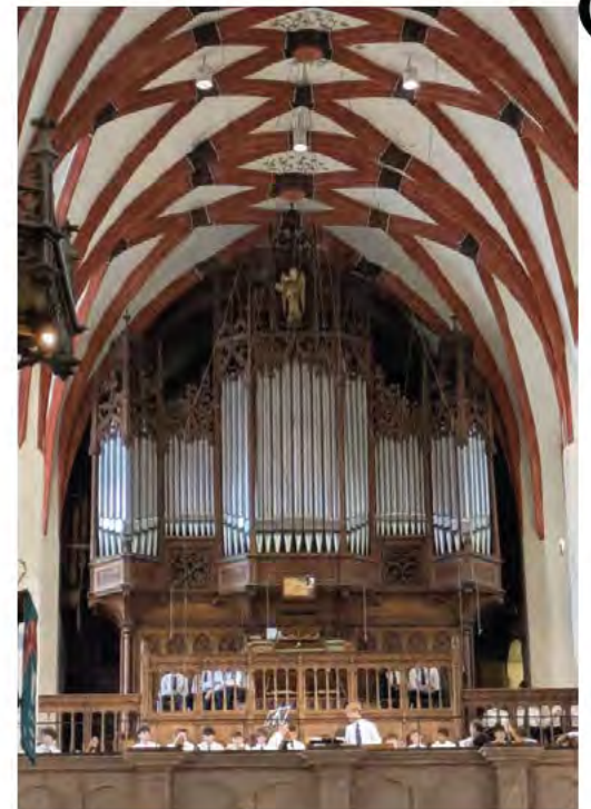
The Thomanerchor and Leipzig Gewandhausorchester at the Thomaskirche in Leipzig, Germany