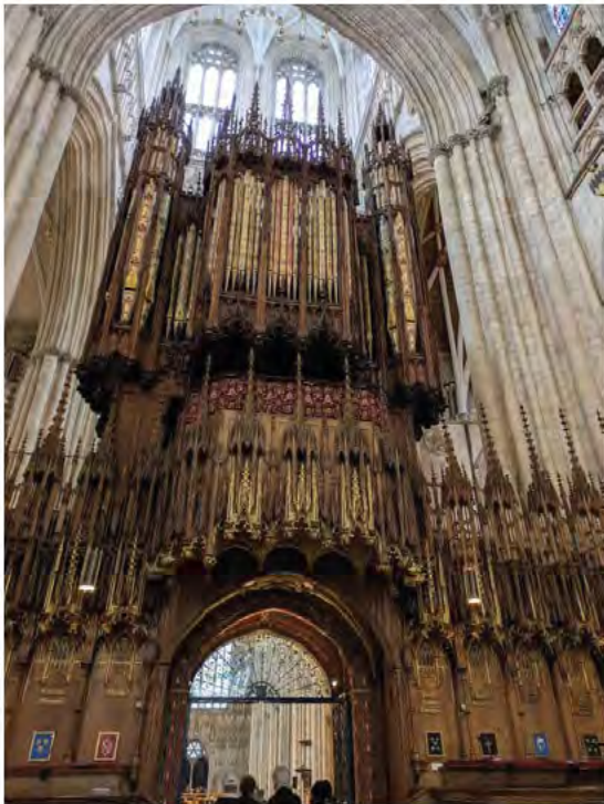
Organ, York Minster