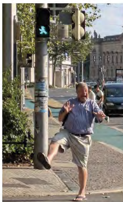
Old DDR walk signal in Leipzig