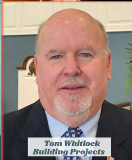
Tom Whitlock Building Projects