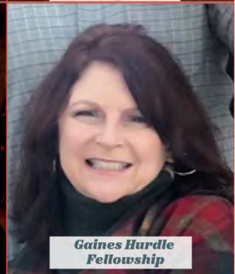
Gaines Hurdle Fellowship